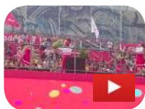
Carnival atmosphere at the Olympic park