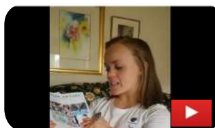
A personal message from Ellie Simmonds to Woodlea!