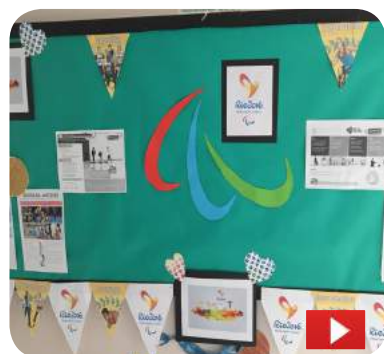
Reasons for taking part