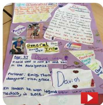
Delivering the programme