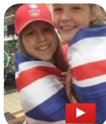
Thank you Sainsbury's