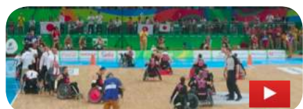
Wheelchair rugby final

On day 4 the group entered the aquatics stadium to enjoy a morning of Paralympic swimming. This was followed by an afternoon of sitting volleyball, where the group watched the teams battle for bronze and gold medals. On the final day before the group departed for London they experienced the men's gold medal wheelchair rugby match.