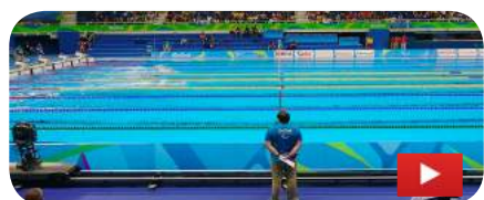
Swimming at the aquatics park

Day 3 provided opportunities for the group to watch the individual bronze and gold medal boccia matches, followed by a trip to the British Paralympic Association Hospitality Centre. The day finished with the goalball final and medal ceremonies.