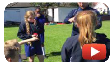
Boccia: How to guide (click picture to play video)