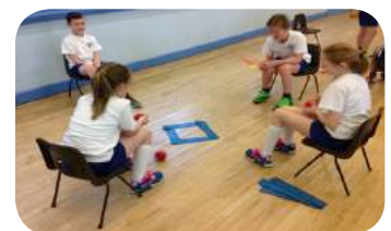
Working in teams

“It’s quite difficult, when you don’t have your eyes, you use your other senses more wisely (Year 6 participant)