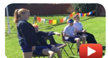
Boccia guide (click picture to play video)