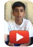
What have you learnt? (click picture to play video)

“It’s quite difficult, when you don’t have your eyes, you use your other senses more wisely (Year 6 participant)