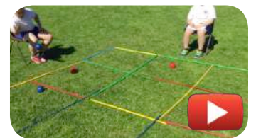
Boccia connect 3 (click picture to play video)