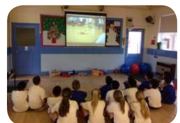
Active Kids Paralympic Challenge Assembly