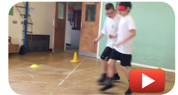
Guided running (click picture to play video)