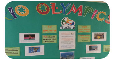
Rio 2016 notice board

On the day of the visit, Kate delivered a circuit of Active Kids Paralympic Challenge activities to her Year 5 class. The children were split into groups of four and took turns at sitting volleyball, boccia, guided running and goalball bowling. Kate asked the children to set up each station, before explaining the rules and asking the children to discuss how the session could be made accessible for everyone: "You can guide people... And you need to give clear instructions for the people who are blindfolded" (Year 5 participant).