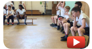
Boccia celebration (click picture to play video)

The children are grateful for the Active Kids Paralympic Challenge resources and the opportunity to try new disability sports: "We are actually really lucky to have the new equipment... Some schools don't even have lessons where you can learn different sports" (Year 5 participants).