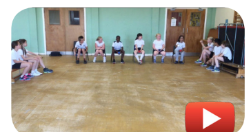
Boccia (click picture to play video)