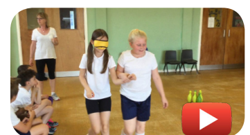
Goalball guide (click picture to play video)