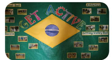
Paralympics notice board