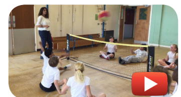
Sitting volleyball (click picture to play video)