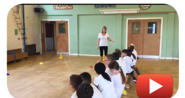
How to guide (click picture to play video)